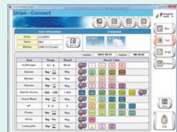
New data input

can input patient's ID and personal information for a new test