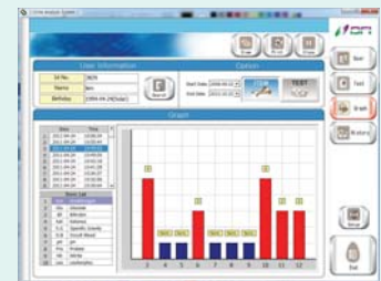
Recall past results

can input patient's ID and personal information for a new test